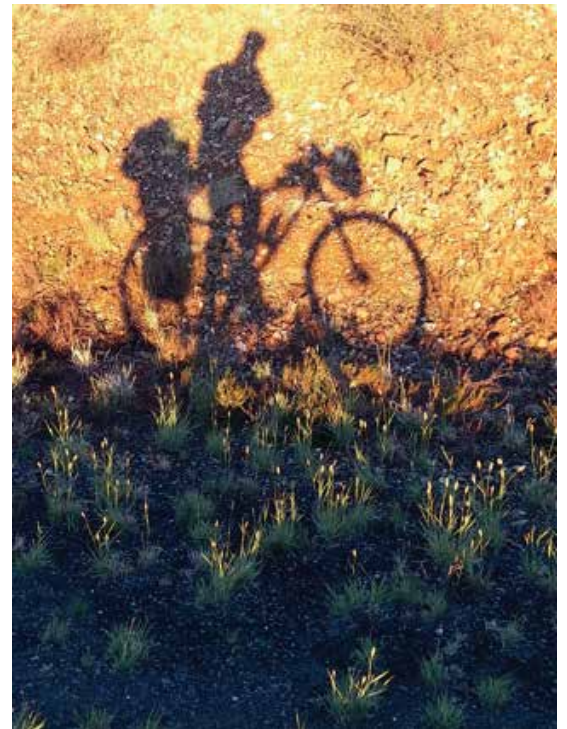
Selfie taken whilst crossing the Great Karoo Eelco Meyjes

The ride took him 44 days of which seven were rest days. Life Lesson: Be flexible, sometimes plan C can be far better than plan A. Ride Lesson: Cycling amongst wildlife.