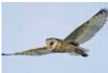
Vulnerable African Grass-Owl