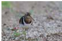
Vulnerable Greater Painted-snipe