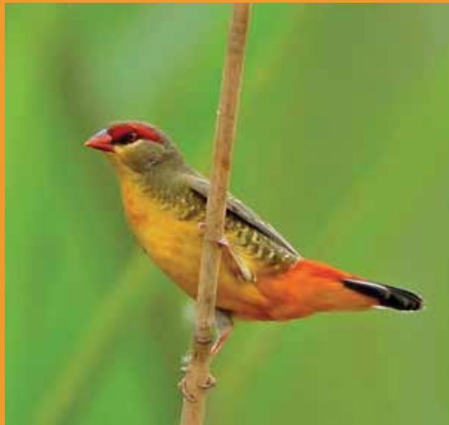
Orange-breasted Waxbill

The purpose of the ride - Recent unexpected declines in Africa's smallest finch, the Orange-breasted Waxbill, has resulted in the need for the species to be researched. Not yet listed as threatened BirdLife South Africa has now selected the species as a key sentinel (watchdog) species for no less than eight threatened bird species and 84 common bird species that all use a similar wetland habitat to itself . It's a small bird with BIG responsibilities.