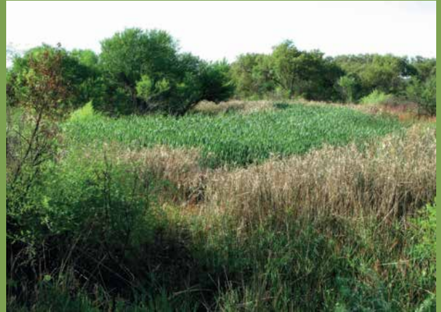
The natural wetland habitat for the Orange-breasted Waxbill.

If we can successfully teach children to appreciate the small things in life the BIG things will take good care of themselves. With time, the small Orange-breasted Waxbill, as a sentinel (watchdog) species that helps save other bird species, will be made into a BIG hero. A very exciting new small is BIG environmental and conservation education puppet show, where the small bird named Waxi the Hero will be portrayed as a lovable hero, is currently being developed for an ongoing schools program and possible TV series. We all want our small children to grow up to be BIG heroes.