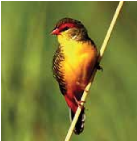
Orange Breasted Waxbill The research data will benefit eight threatened species