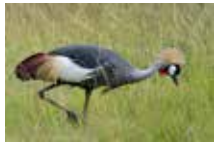
Endangered Grey Crowned Crane