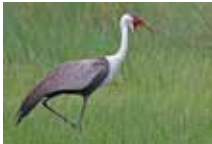
Critically Endangered Wattled Crane