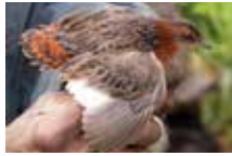
Critically Endangered White-winged Flufftail