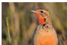
Near Vulnerable Rosy-throated Longclaw