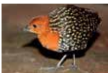
Vulnerable Striped Flufftail