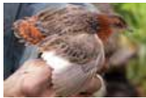
Critically Endangered White-winged Flufftail