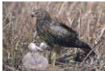
Endangered African Marsh-Harrier