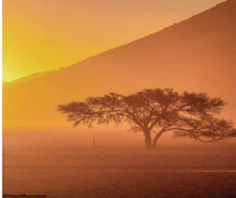
A desert storm in Namibia

On 19 February 2017 Eelco Meyjes will start his small is BIG fundraising cycle ride. The target is R300,000. The distance will be 3600km. It will AGAIN be an unsupported solo cycle ride. It will start in Cape Town, cross Namibia and go across the top end of Botswana and end at the mighty Victoria Falls. He hopes to complete the ride in 67-70 days. A major new challenge for him will be to try and cross large sections of the Namib Desert. Managing water supplies, cycling on soft sand, cycling on long stretches of corrugated dirt roads and avoiding desert storms will be a key challenge. If he does successfully cross the Namib Desert and reach Walvis Bay (at 1950km he will be just over the halfway mark) the next major challenge for him will be to pick himself up mentally to complete the rest of the 1650kms ride to Victoria Falls. This will include quite a few areas where he will be cycling amongst wildlife.