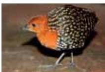
Vulnerable Striped Flufftail