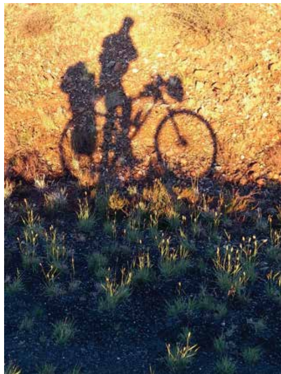
Selfie taken whilst crossing the Great Karoo Eelco Meyjes

The ride took him 44 days of which seven were rest days. Life Lesson: Be flexible, sometimes plan C can be far better than plan A. Ride Lesson: Cycling amongst wildlife.